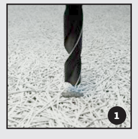
Use the wood drill to make the holes equal in diameter