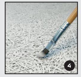
Use touch-up paint with the same colour as the panel