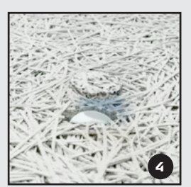
Place the drilled pieces of cement-bonded wood wool in the holes with sealant