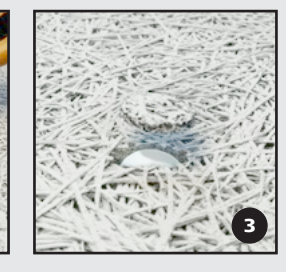
Cut the cement-bonded wood wool to size, and use it to fill the hole