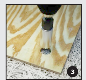
Use the cup drill to drill out small pieces of cementbonded wood wool from a surplus panel or sample. The pieces must be the same diameter as the holes